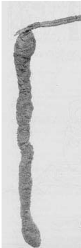
FALSE BRAID ATTACHED TO TABLET WOVEN BAND