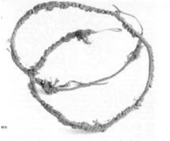
SILK WRAPPED CIRCLET